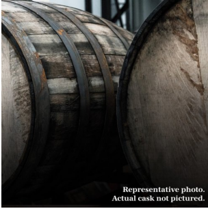
Representative photo. Actual cask not pictured.