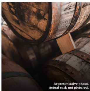
Representative photo. Actual cask not pictured.